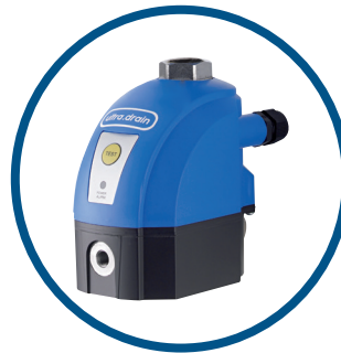
Level Controlled Drain